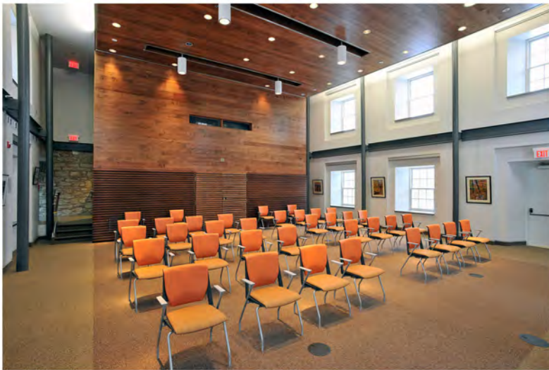
Contemporary meeting space within historic jail block