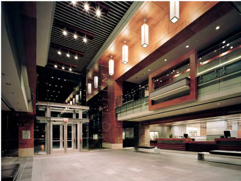
The Atrium of the recently opened addition to Milton Town Hall